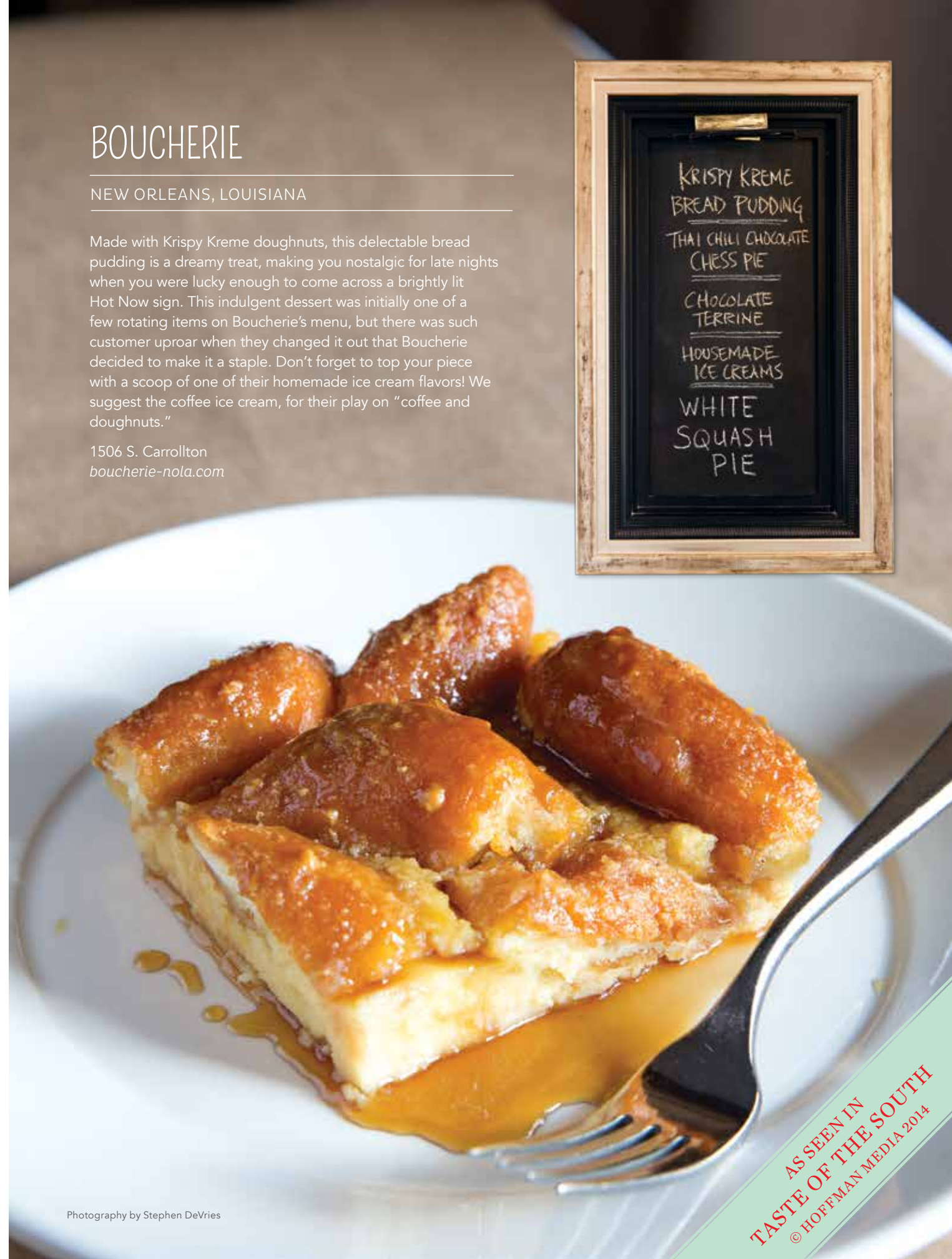
Photography by Stephen DeVries

AS SEEN IN TASTE OF THE SOUTH © HOFFMAN MEDIA 2014